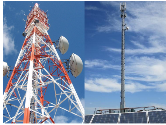
Fig. 1. Antennas mounted on a lattice tower (on the left), antennas mounted on a monopole (on the right).

Standards are a very important part of engineering practices, serving as rules that engineers must comply. Structural design